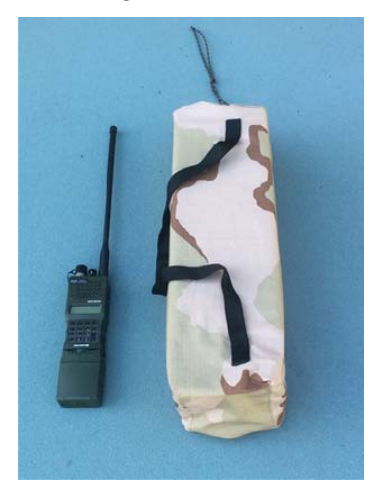
Fig. 1. LP MBWA ensemble for omnidirectional coverage in a camouflage bag beside an Army multiband radio AN/PRC-152.

The LP MBWA is a utilitarian ensemble akin to the Swiss knife, hand axe, and ropes for the seasoned mountaineer. Fig. 1 shows the LP MBWA ensemble in a camouflage bag placed beside an Army handheld (AN/PRC-152) to radio show its size and shape. The LP MBWA, with a total weight of about 1.5 Kg, covers all five LP bands (30 to 2000 MHz) contiguously with omnidirectional pattern coverage.